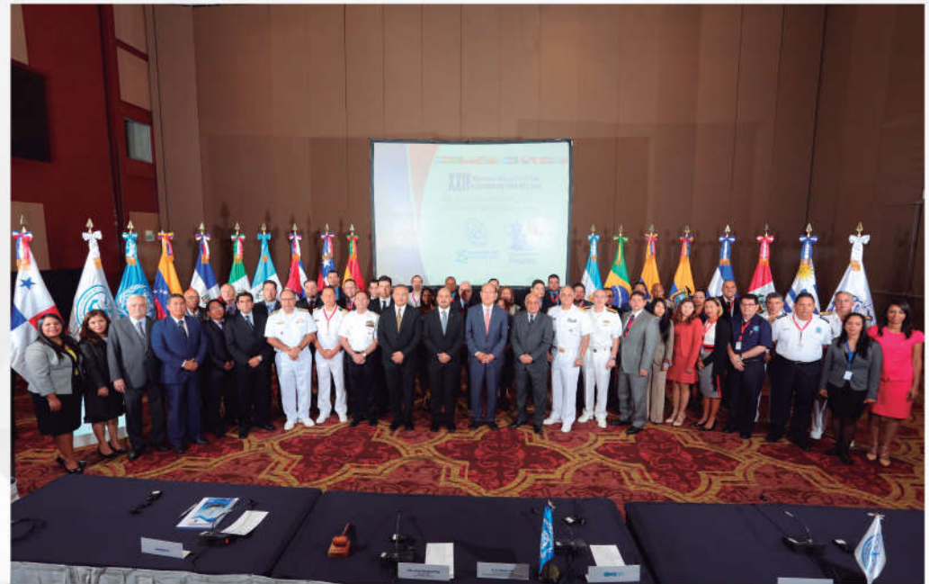
During the XXIV Meeting of Member States of this important Organization

World Maritime Day Parallel Event Panama - October 1-3, 2017